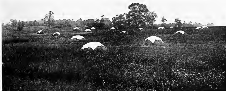
Plats of the Meadow-Mixtures Experiment Located on the Agronomy Farm in 1923. Canvas Cock Covers Were Used on the Partly-Cured Hay

AGRICULTURAL EXPERIMENT STATION COLLEGE OF AGRICULTURE, WEST VIRGINIA UNIVERSITY F. D. FROMME, Director MORGANTOWN